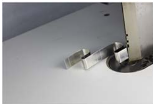
Stainless steel processing