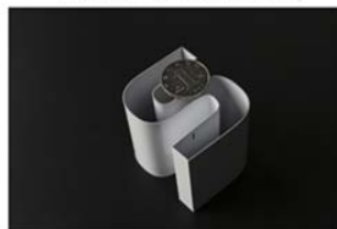
Aluminum plate sample display