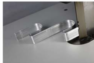
Aluminum profile processing