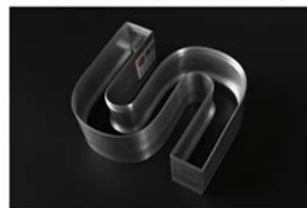
Super sign sample display