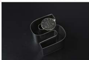
Stainless steel sample display