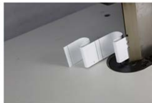
Aluminum plate processing